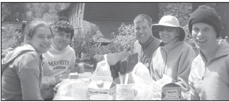
Members of Mammoth High School running team and coaches enjoy bagels before work on Panorama Dome Summer of Stewardship Program.