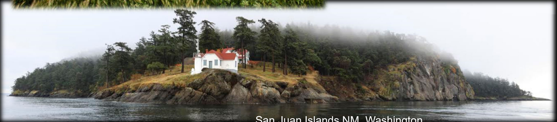
San Juan Islands NM, Washington