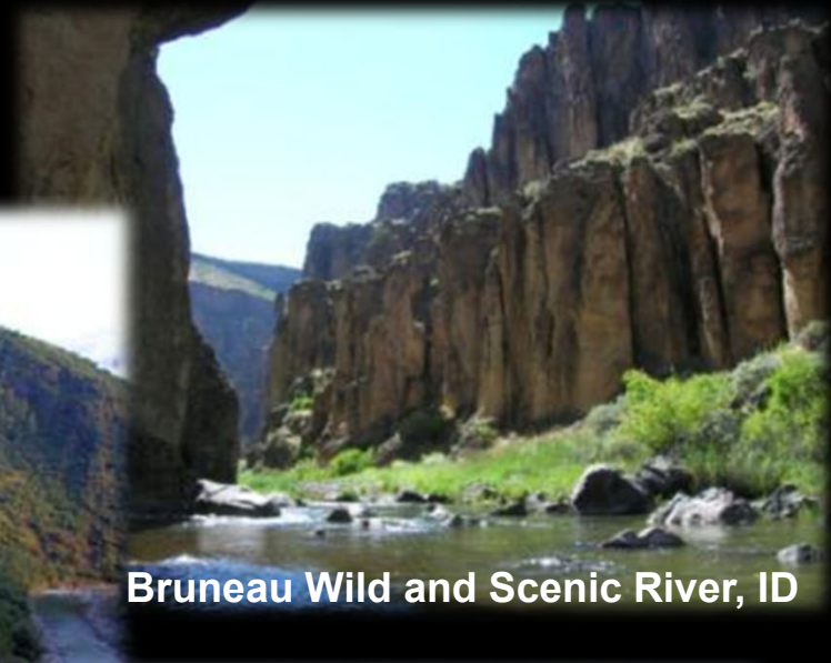
Bruneau Wild and Scenic River, ID