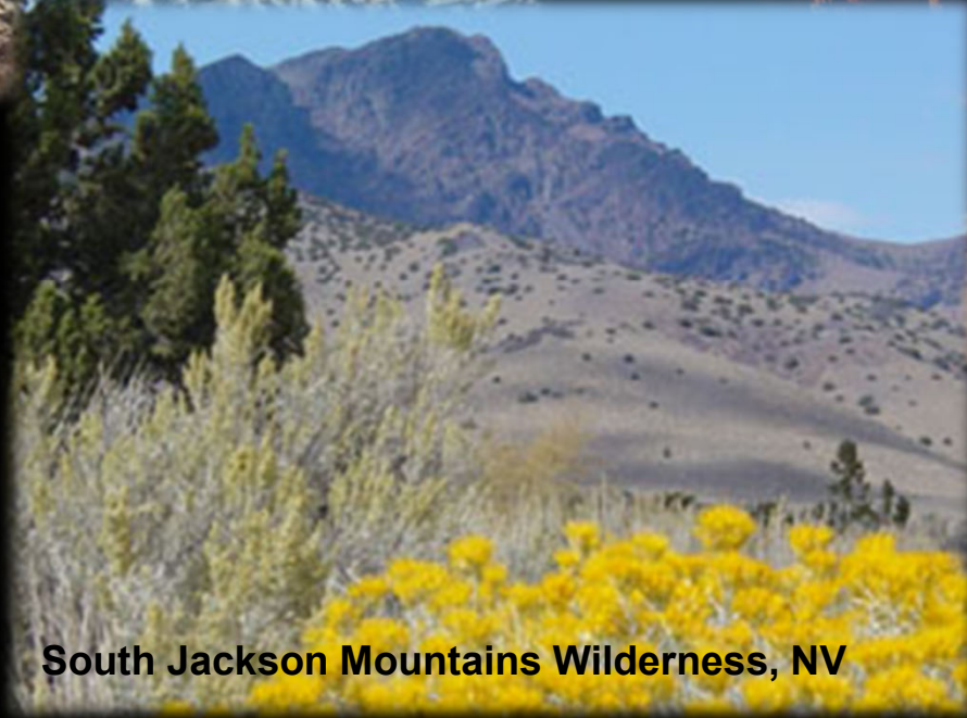
South Jackson Mountains Wilderness, NV