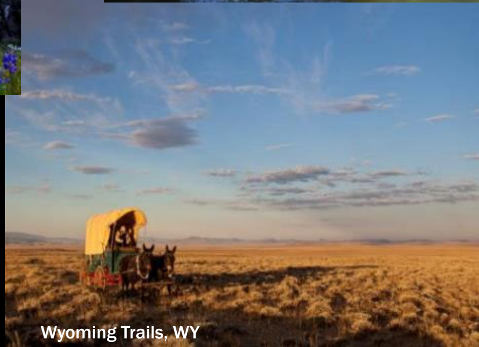
Wyoming Trails, WY