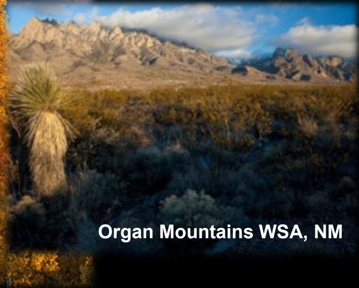
Organ Mountains WSA, NM