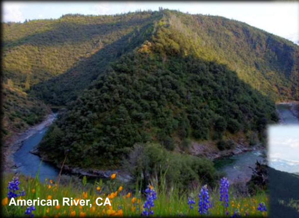
American River, CA