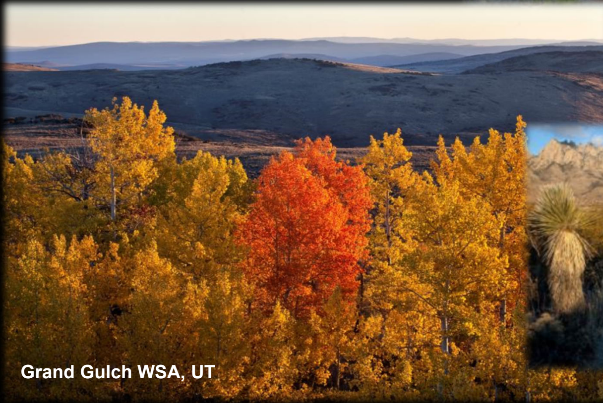
Grand Gulch WSA, UT