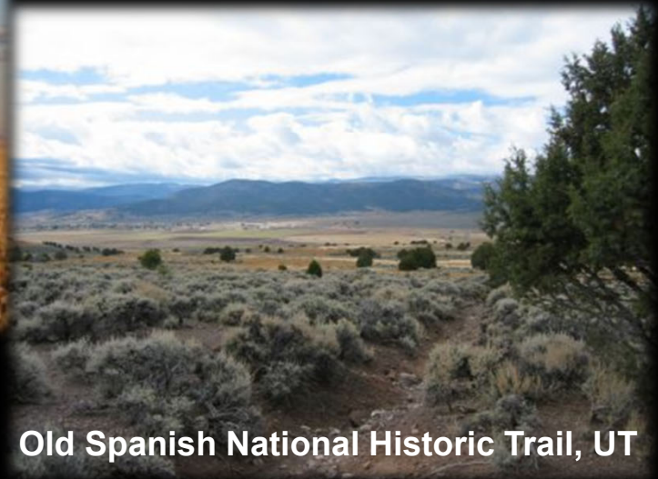
Old Spanish National Historic Trail, UT