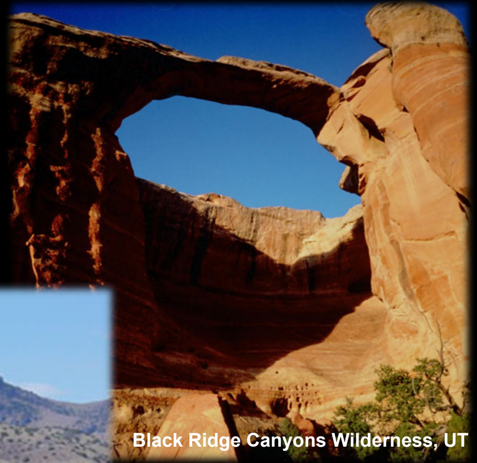
Black Ridge Canyons Wilderness, UT