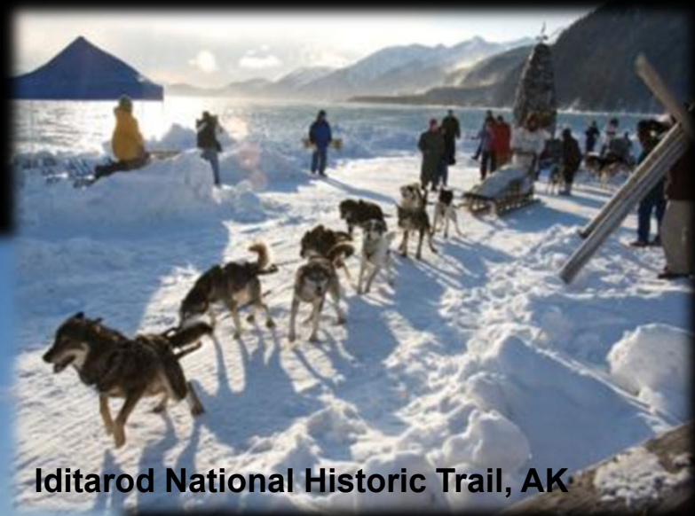
Iditarod National Historic Trail, AK