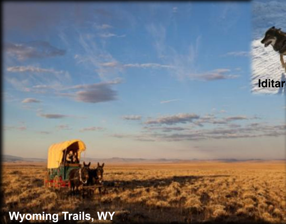
Wyoming Trails, WY