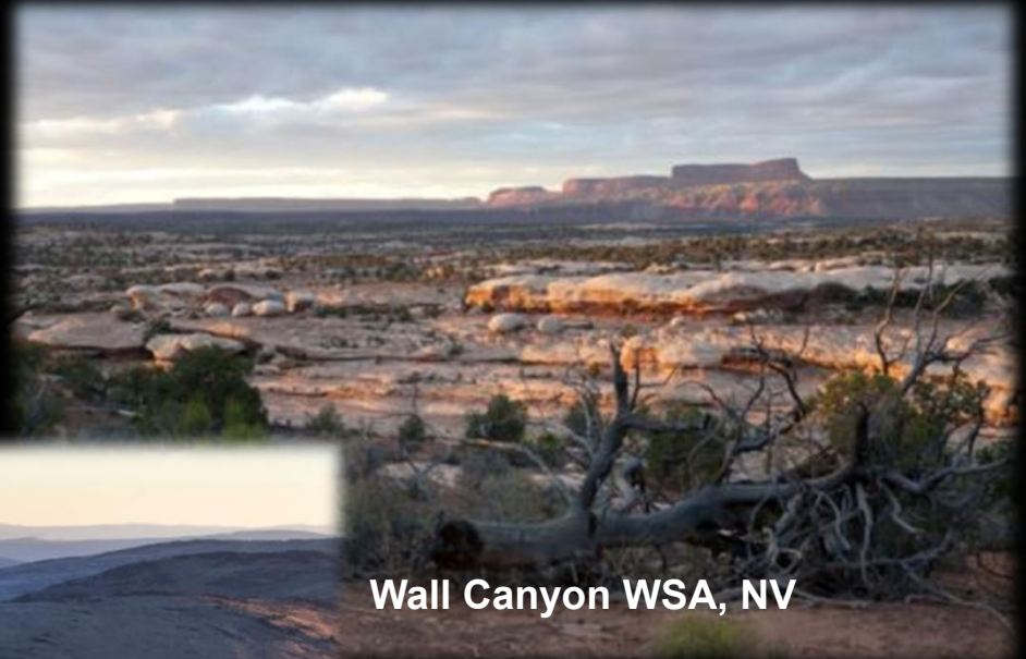
Wall Canyon WSA, NV