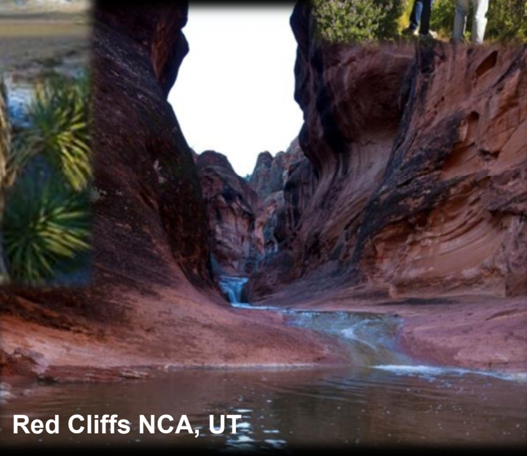
Red Cliffs NCA, UT