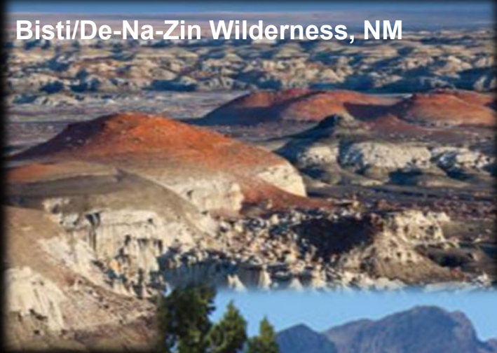
Bisti/De-Na-Zin Wilderness, NM