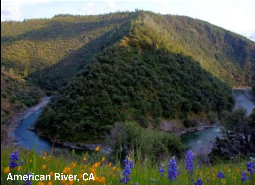
American River, CA