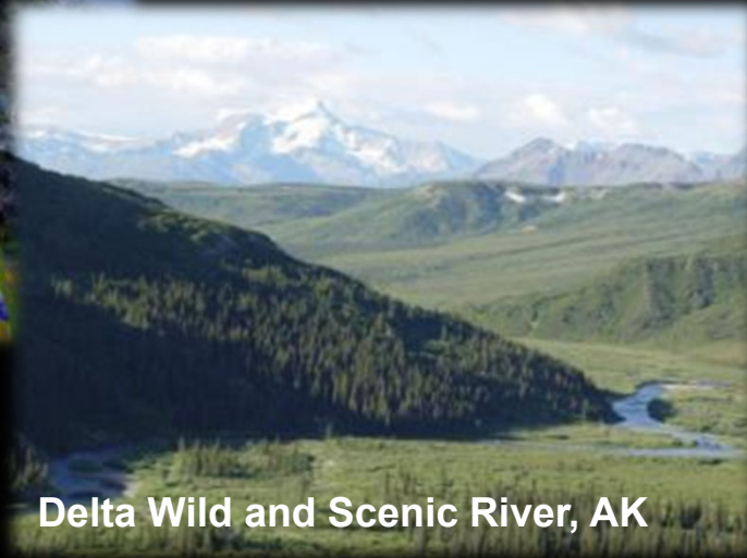
Delta Wild and Scenic River, AK