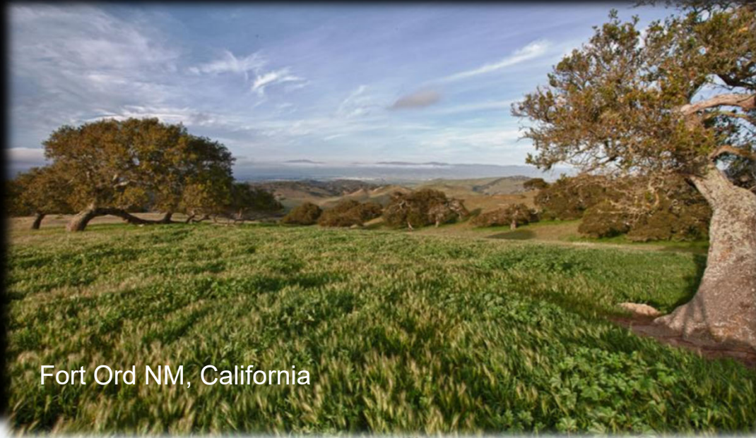
Fort Ord NM, California