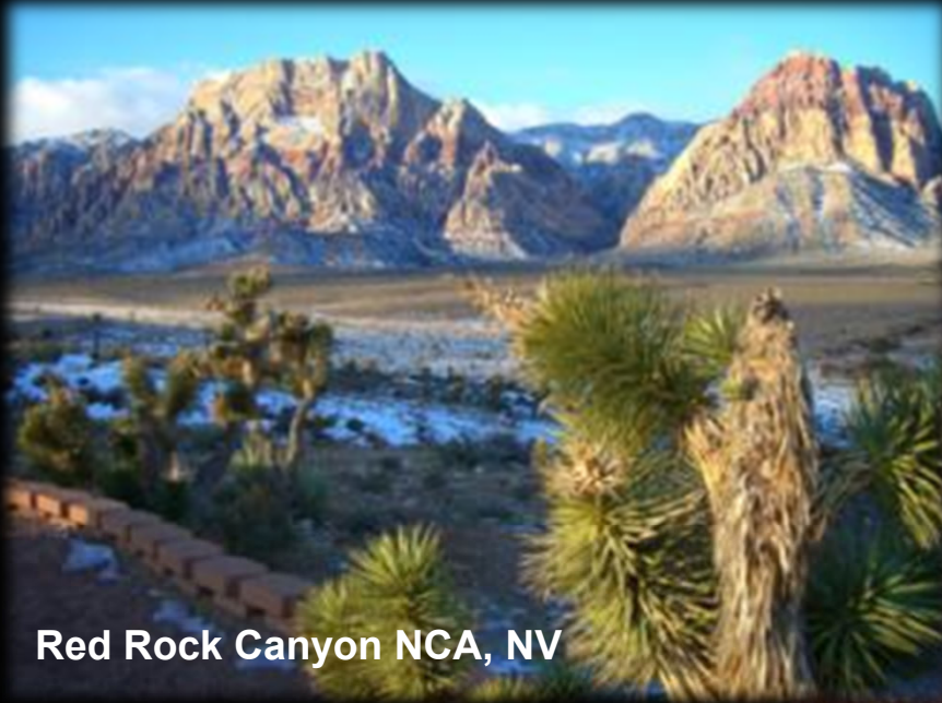
Red Rock Canyon NCA, NV