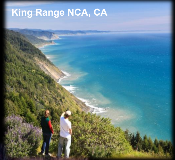
King Range NCA, CA