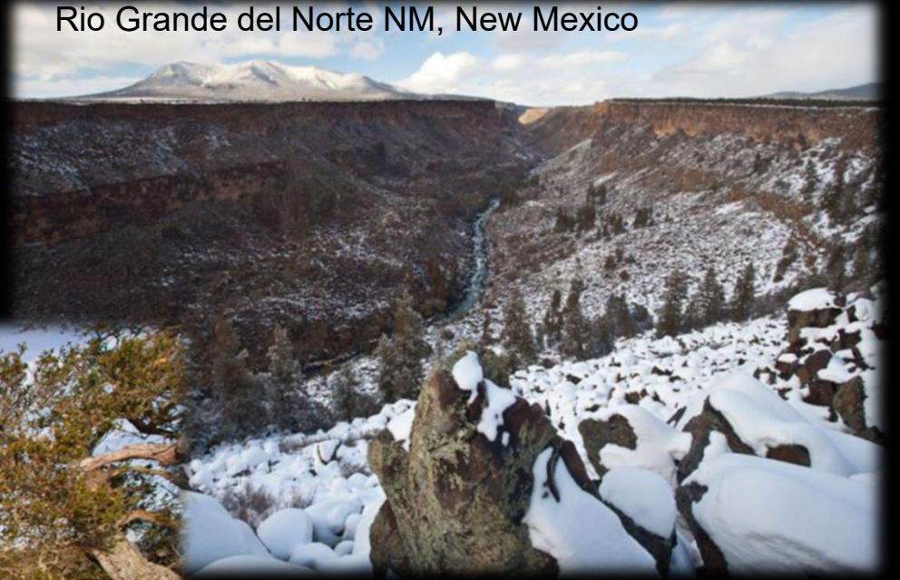
Rio Grande del Norte NM, New Mexico