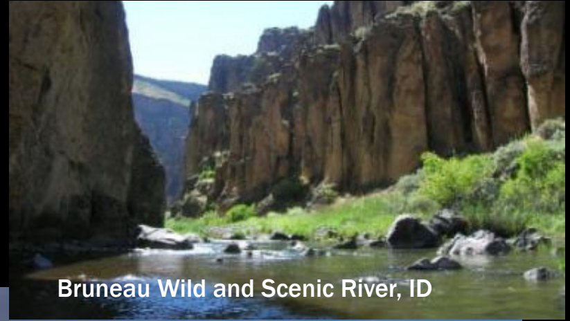
Bruneau Wild and Scenic River, ID