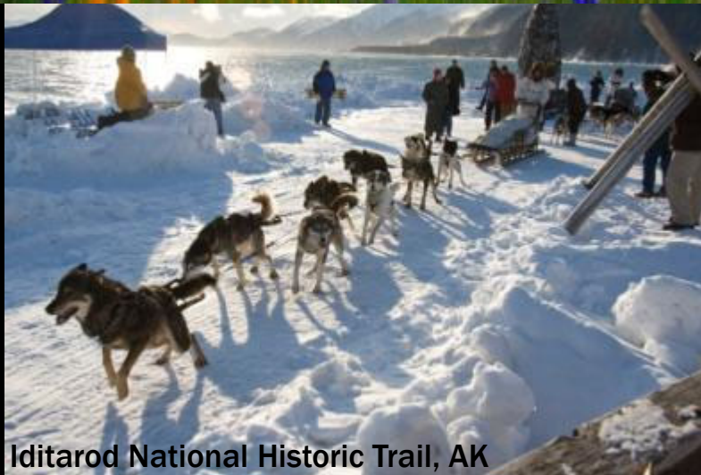
Iditarod National Historic Trail, AK