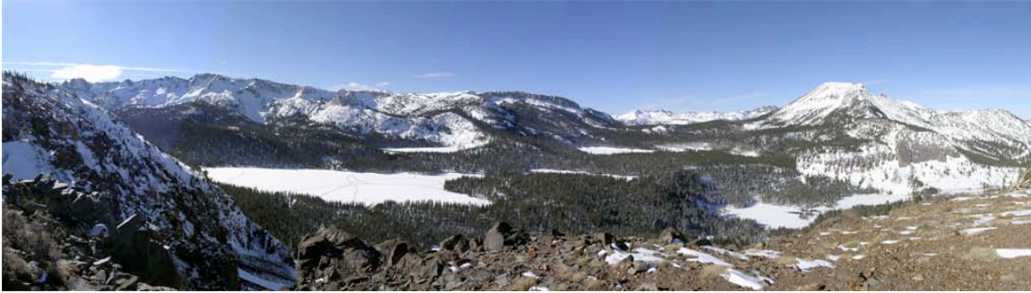
The Mammoth Crest and Mammoth Mountain Ski Area from the lower Sherwin Ridge looking South and West.