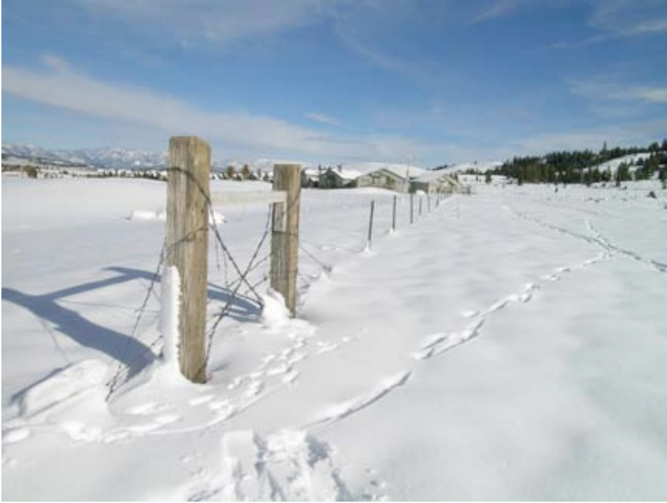
The fence at the edge of the golf course looking East...