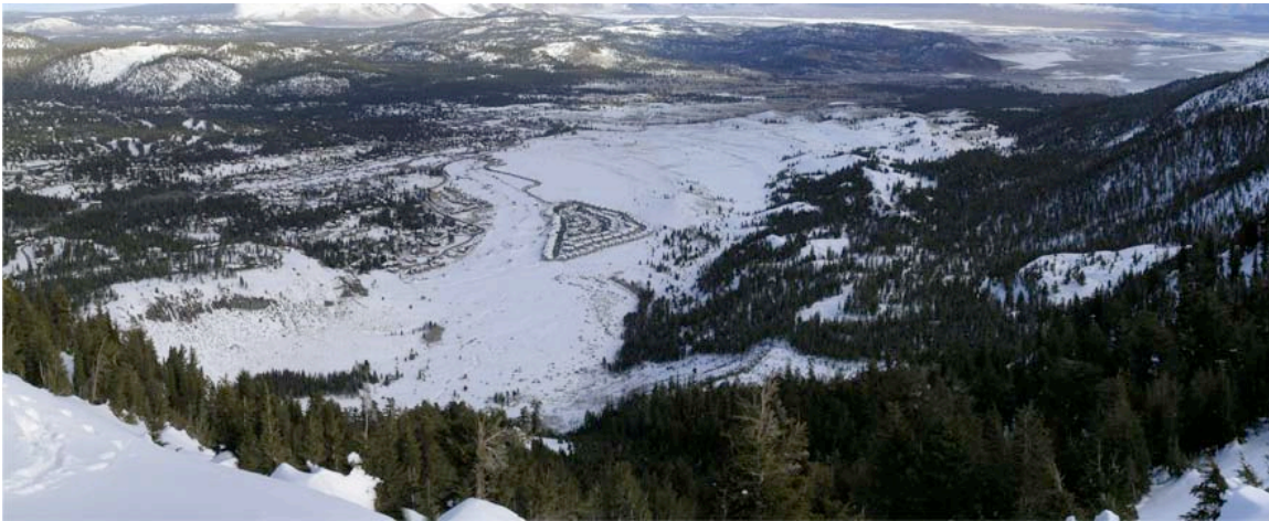
Once you've gained the main Sherwin Ridge, this is your view looking North and East. You're above Mammoth Rock, looking down towards the town of Mammoth Lakes. The prominent development in the center of the photo is Snowcreek. Ranch Road and the Gate are to its left across the snow covered open space which is the Snowcreek golf course covered with snow.