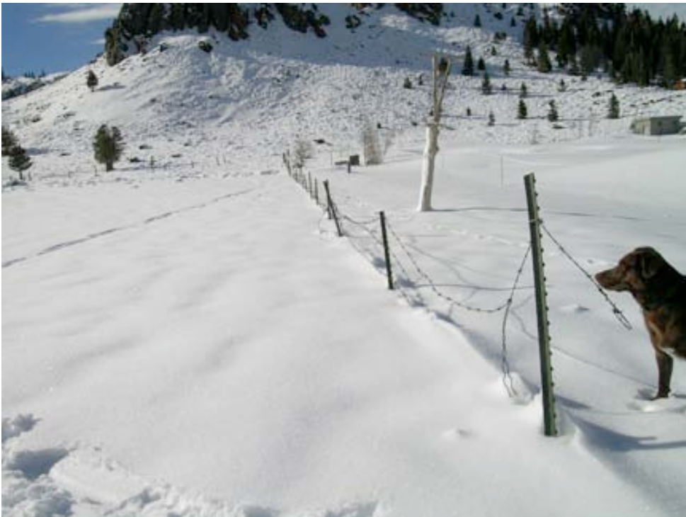
The fence at the edge of the golf course looking West. The hill in the background is the bottom of The Bluffs.