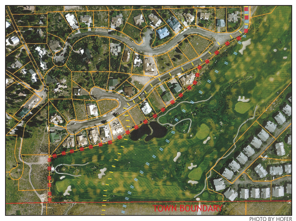
The red line = proposed exit route of Lande and homeowners. The yellow and blue lines = existing routes favored by backcountry users.